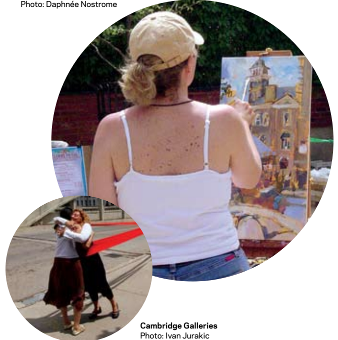
Cambridge Galleries