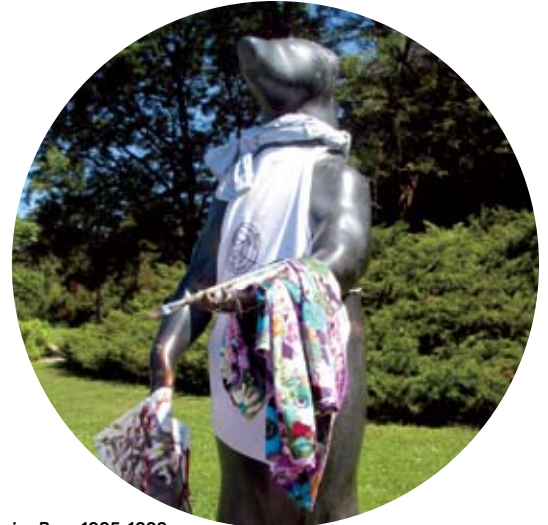
Carl Skelton, Canadiana/Begging Bear , 1995–1999

Exhibition Park Sat & Sun: 12 pm–1 pm ALL AGES