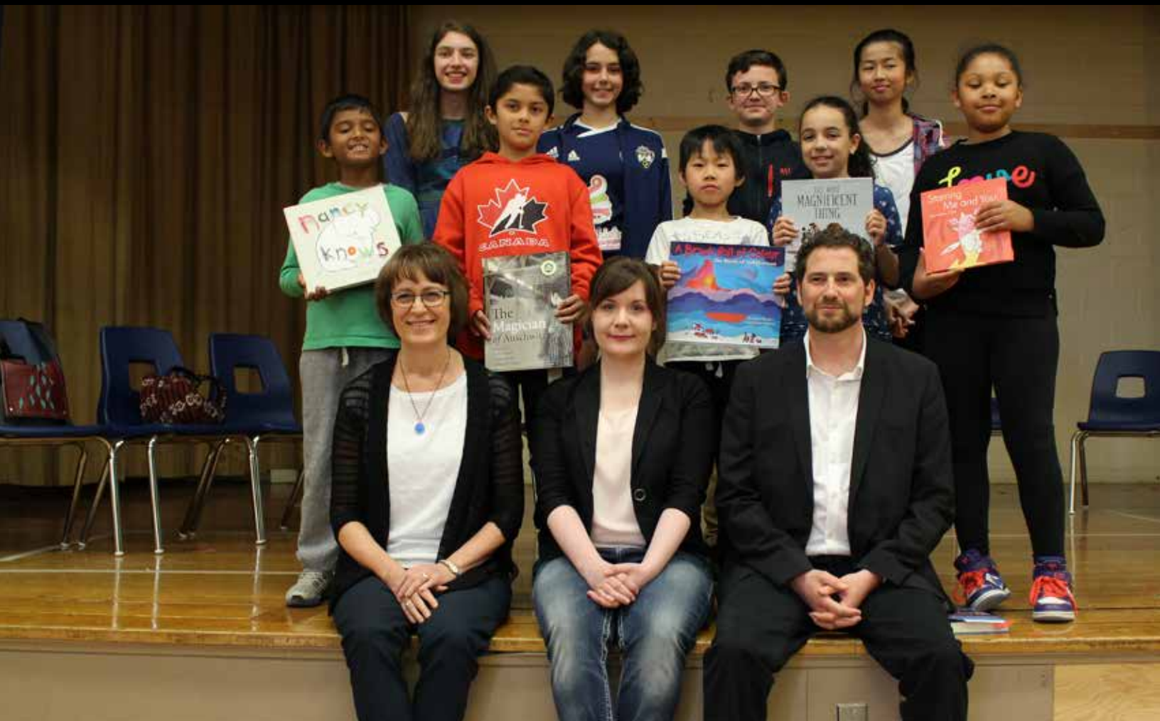
(Front row, from left) Ruth and Sylvia Schwartz Children's Book Awards laureates Kathy Kacer, Gillian Newland and Kenneth Oppel pose with student jurors from Alexander Muir/Gladstone Avenue Junior and Senior Public School in Toronto.