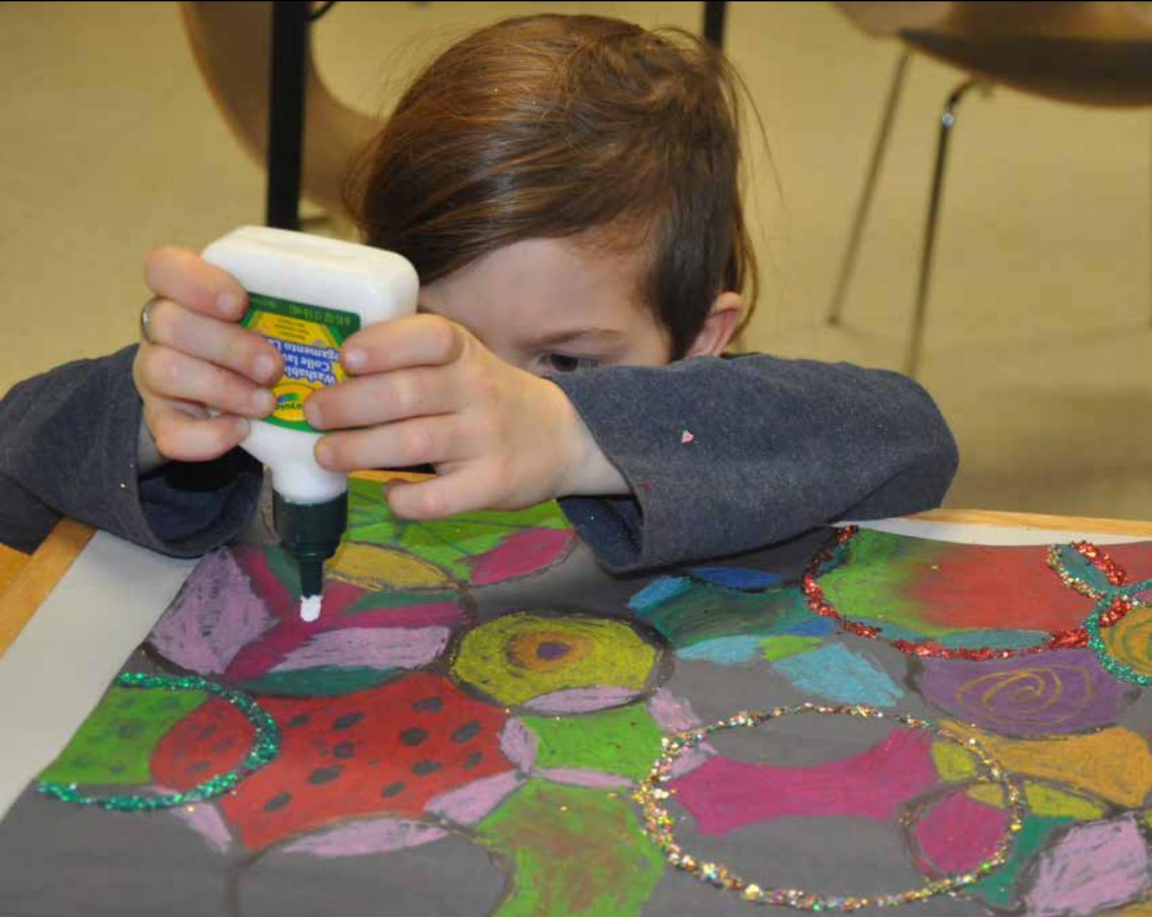
A student at Queen Victoria School in Belleville participates in Colours in Circle , an arts education project led by artist educator Emebet Belete.