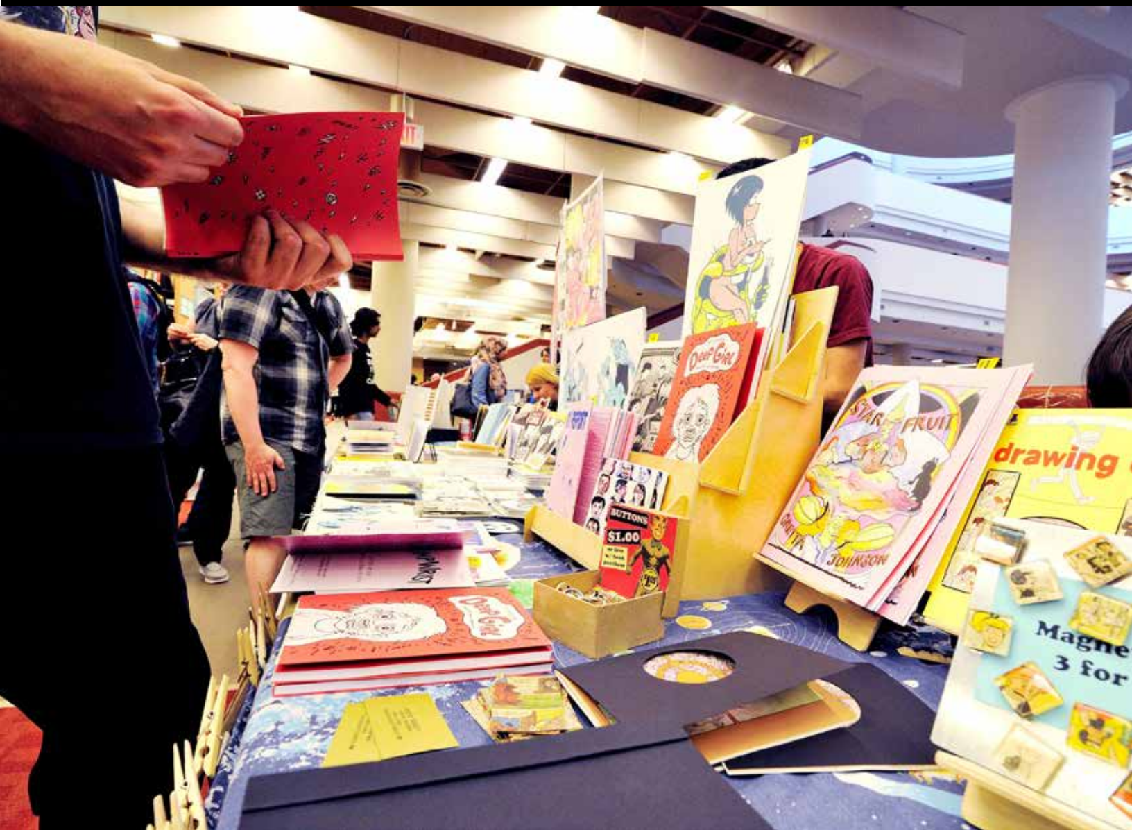
Small-press publisher Paper Rocket displays assorted books during the Toronto Comic Arts Festival at the Toronto Reference Library.

Paper Rocket, petite maison d'édition spécialisée dans la BD, expose une gamme de livres à la Bibliothèque de référence de Toronto pendant le Toronto Comic Arts Festival.