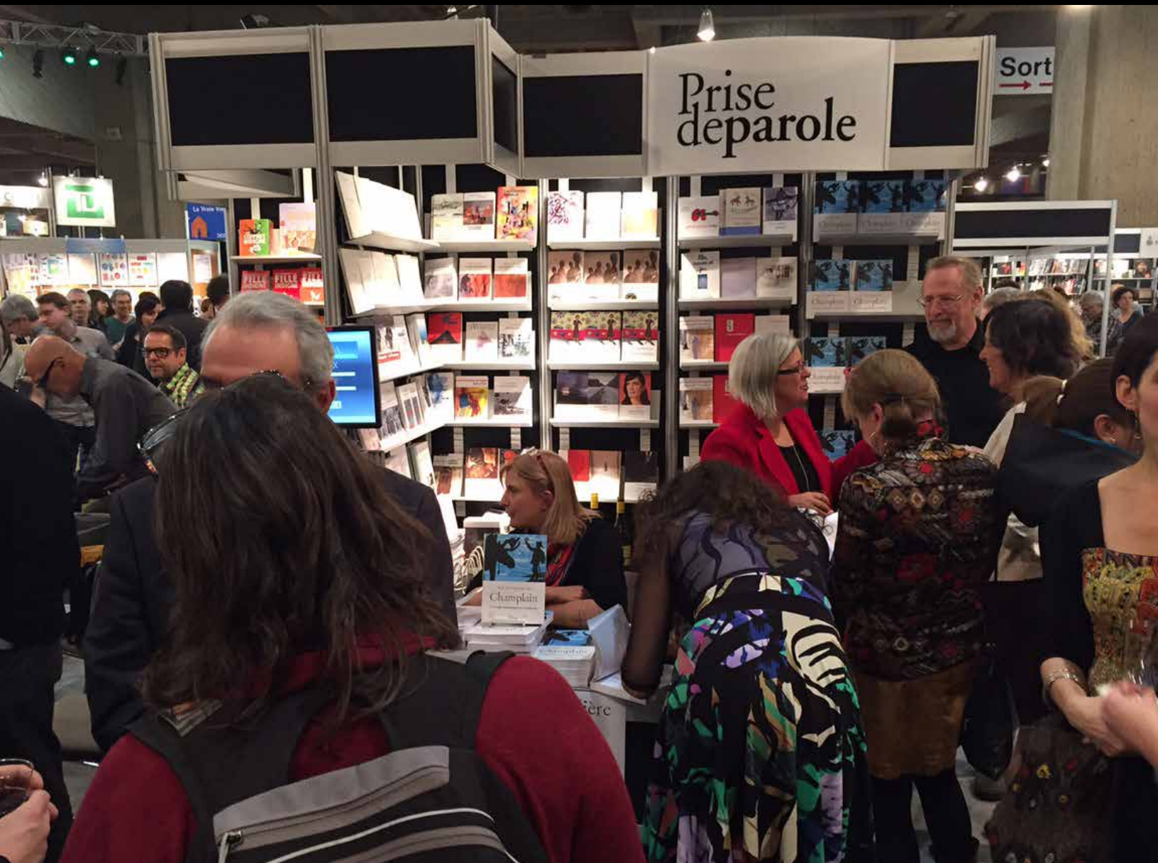
Le kiosque des Éditions Prise de parole au Salon du livre de Montréal.