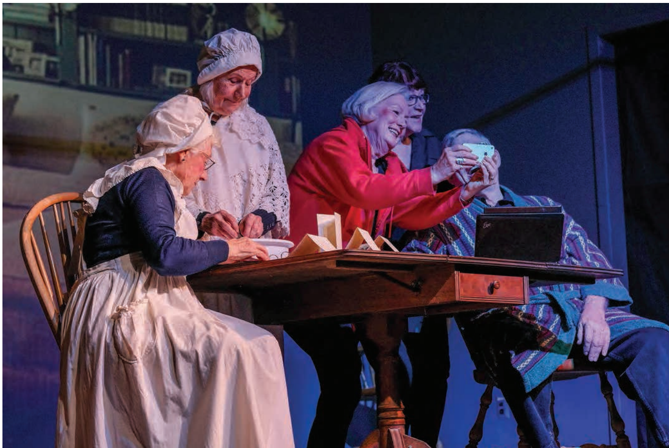
Members of the Our Voices seniors' theatre creation project perform their Canada 150 production of Canada's Seniors: Our Roots, Our Future at the Eden Mills Community Hall in 2017.