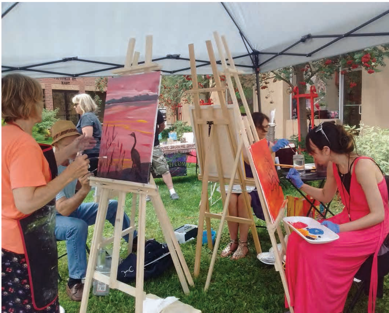
Artists compete in a friendly round of Battle of the Brushes, organized by the South Simcoe Arts Council.