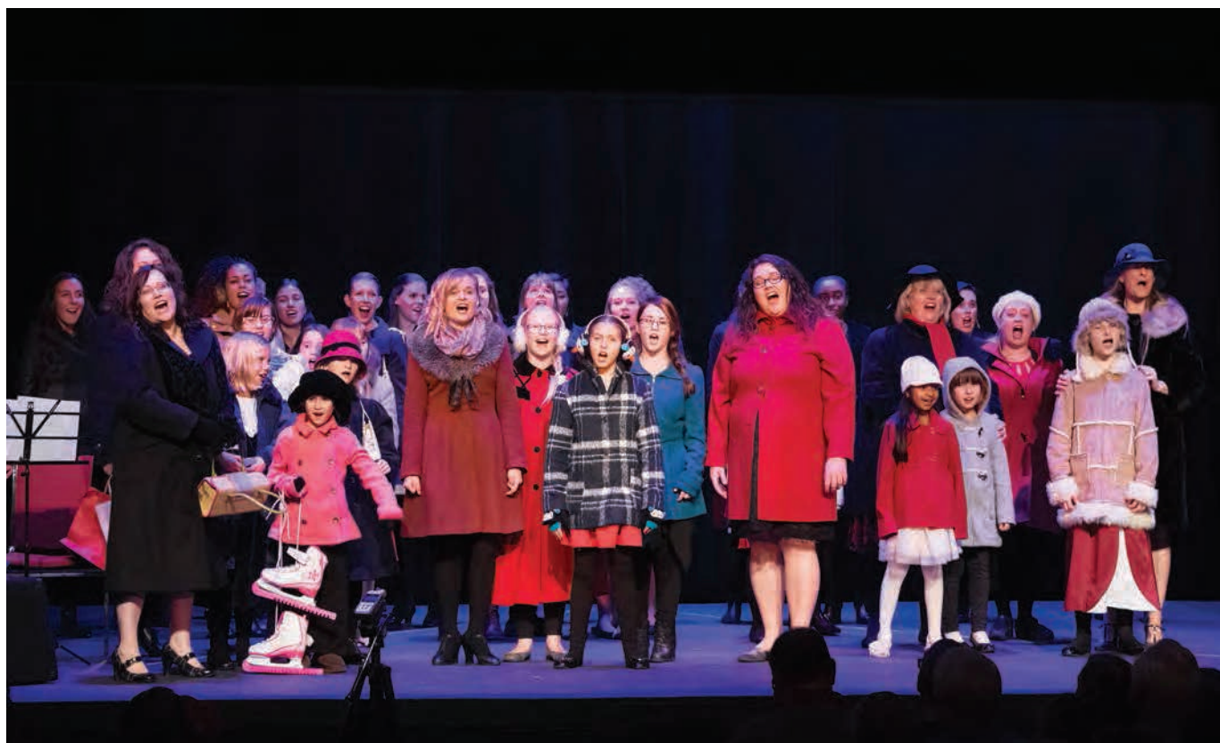
The Arcady singers perform at There's a Song in the Air: A Timeless Holiday Classic , featuring music composed by Ronald Beckett, at the Cambridge Arts Theatre.

L'ensemble Arcady dans There's a Song in the Air: A Timeless Holiday Classic , spectacle présenté au Cambridge Arts Theatre pour lequel Ronald Beckett a composé la musique et assuré la mise en scène.