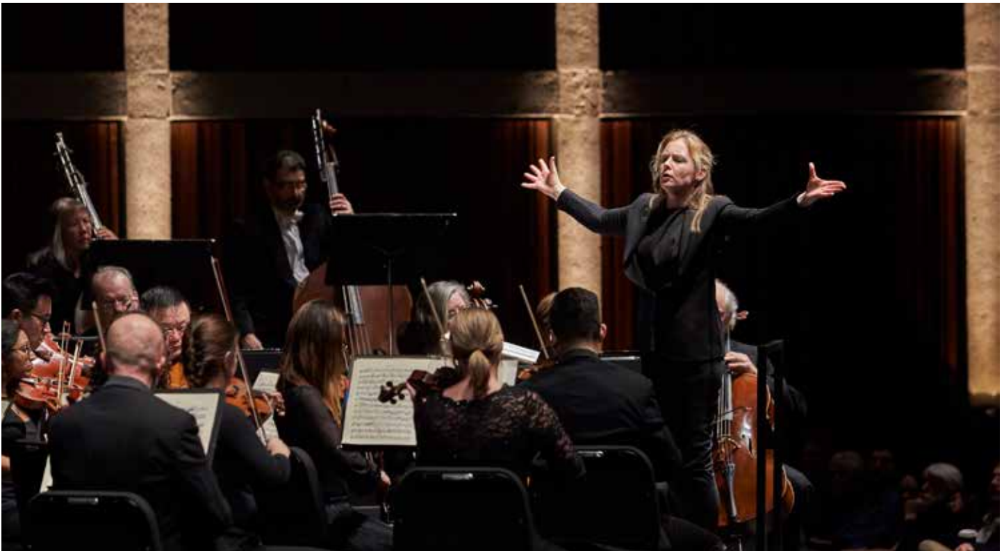
▲ Gemma New, music director of the Hamilton Philharmonic Orchestra, conducts a performance.