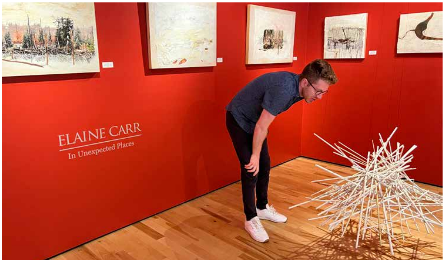
▼ In Unexpected Places , une exposition personnelle de l'artiste Elaine Carr de Windsor à la Sivarulrasa Gallery à Almonte.