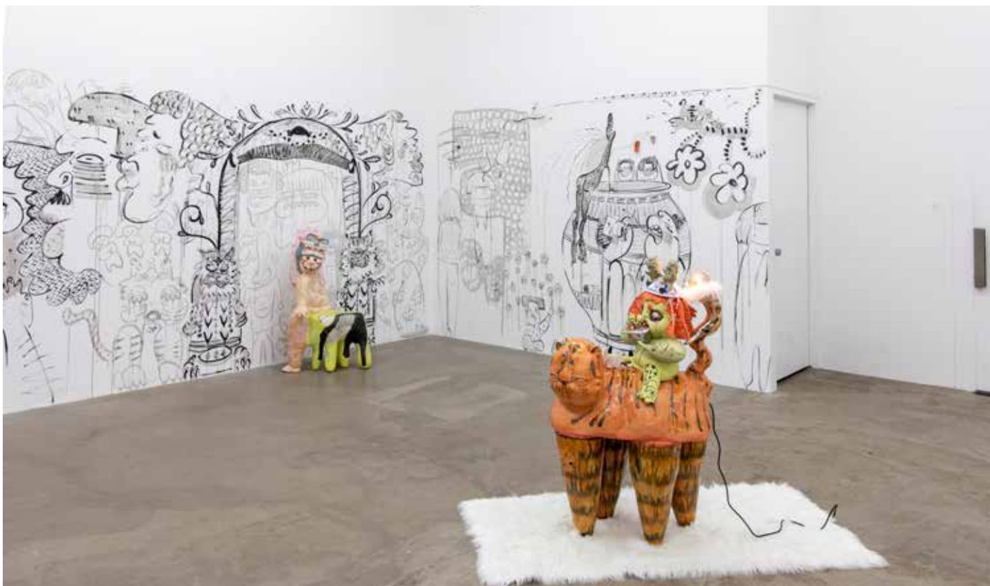
▼ Vue des installations Emerging Woman (gauche) et Panda for Dinner (droite) de l'exposition personnelle A Good Hard Look de l'artiste Sami Tsang à la Cooper Cole Gallery à Toronto.